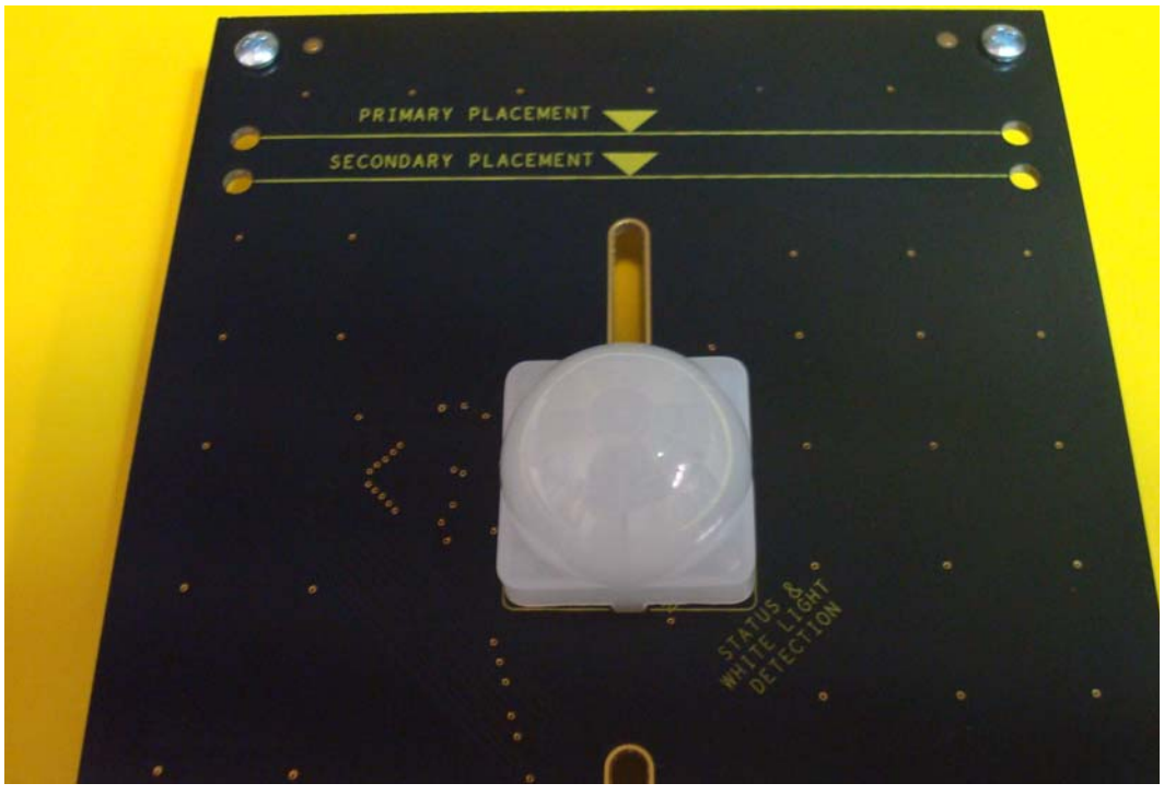
Figure 2. Assembled Clip-In Lens Installed on the ZMOTION 20-Pin Detection and Control Development Board