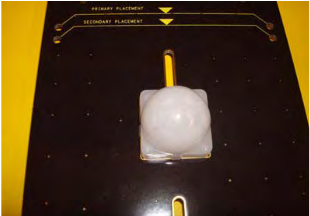
Figure 2. Assembled Clip-In Lens Installed on the ZMOTION Detection and Control Development Board