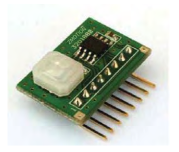
Right-Angle connector version shown (ZEPIROAAS02MODG)

Straight connector version also available (ZEPIROABS02M0DG)